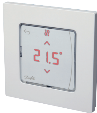
Danfoss Icon ™ Room Thermostat 088U1051