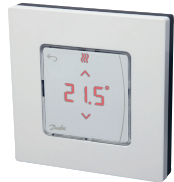
Danfoss Icon ™ Room Thermostat 088U1055

Danfoss Icon ™ 24 V thermostat offers a minimalistic design that makes them fade away and blend into surroundings when the display is not active. The thermostats use powerline communication which makes installation very easy.